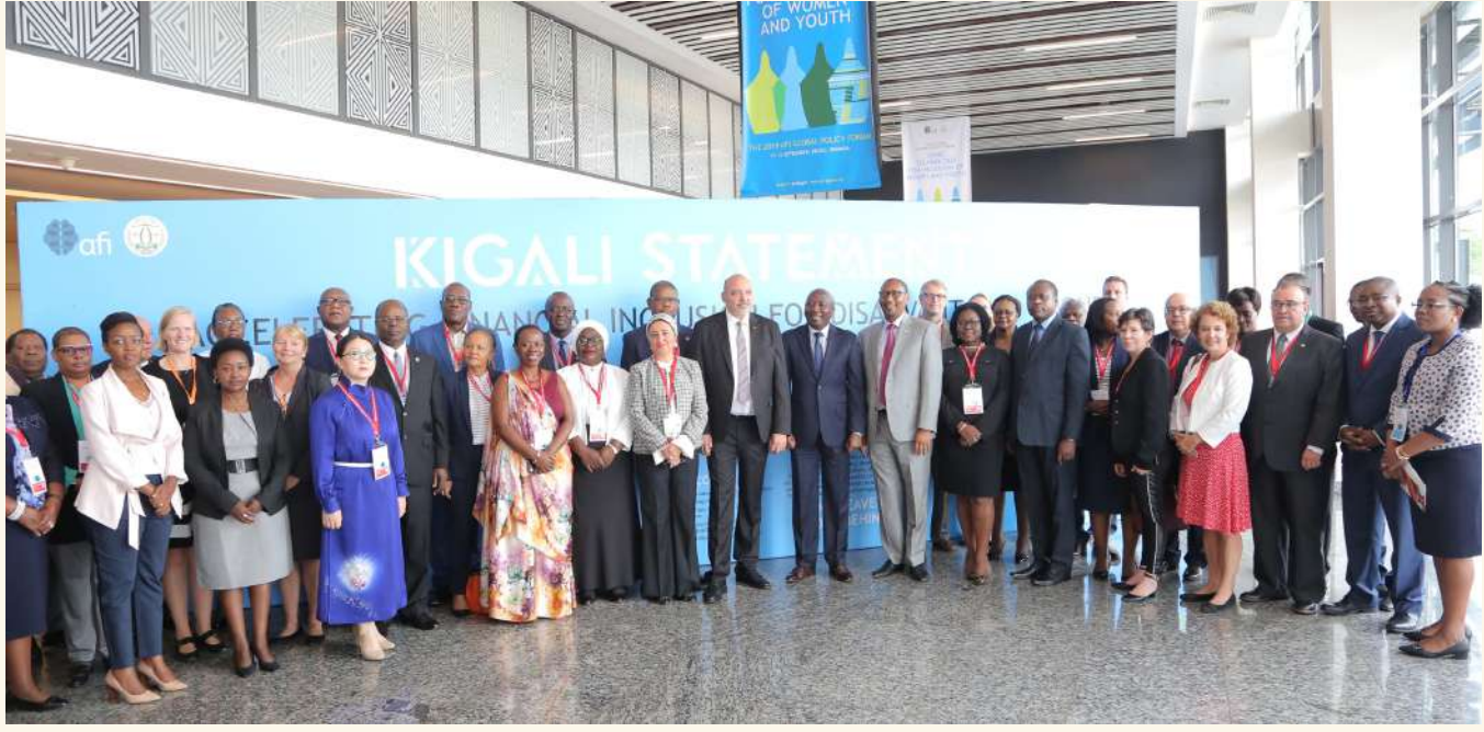
Prime Minister Dr. Édouard Ngirente takes a group photo with Governors and their deputies following the opening ceremony of 2019 AFI GPF.